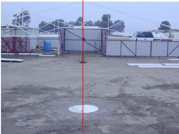
The WHEEL CHANNEL located on the hangar centerline

Secure all of the stakes to the wheel channel using 1 5/8" deck screws.